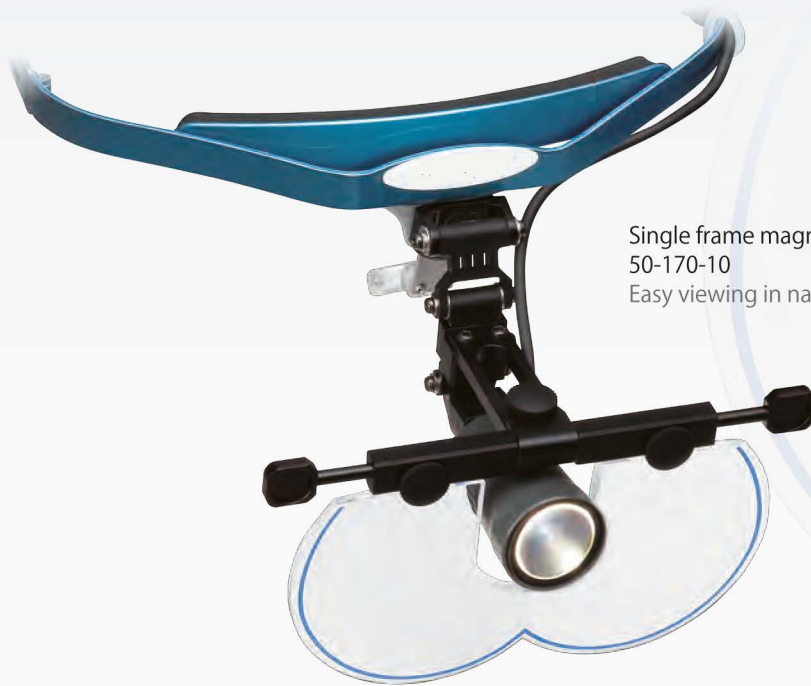
Single frame magnification lens (x 1.7 / x 2.0) 50-170-10 Easy viewing in narrow areas