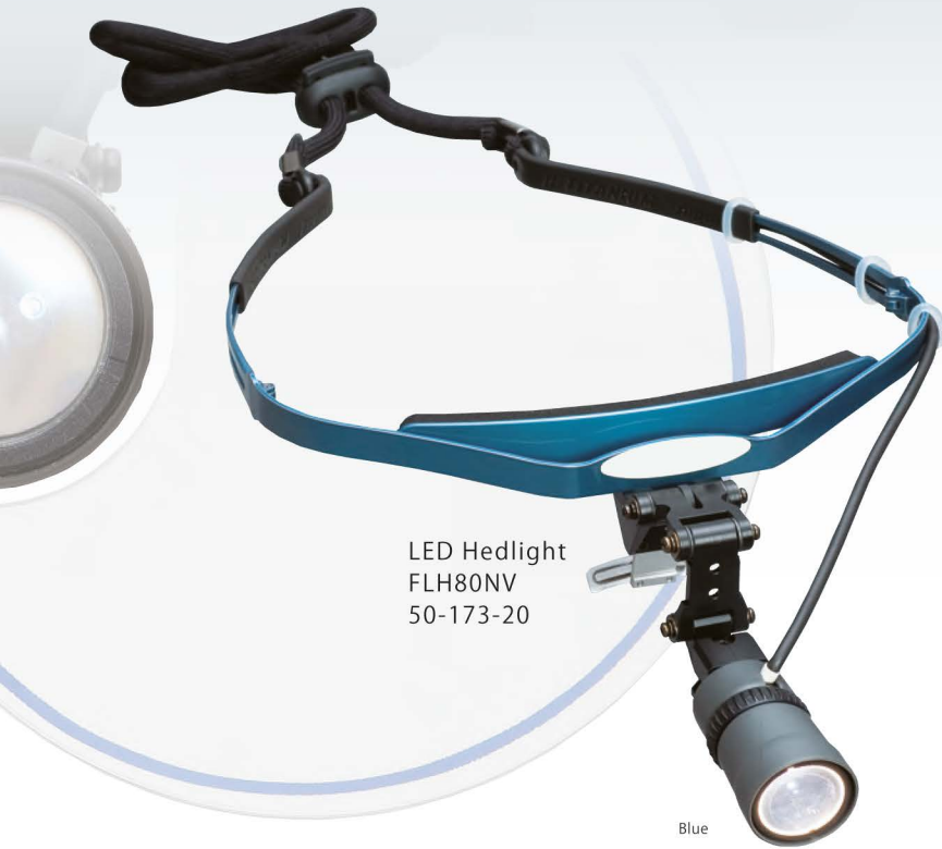
LED Hedlight FLH80NV 50-173-20