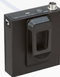
Enloop Battery Set 50-160-10 No Special battery required